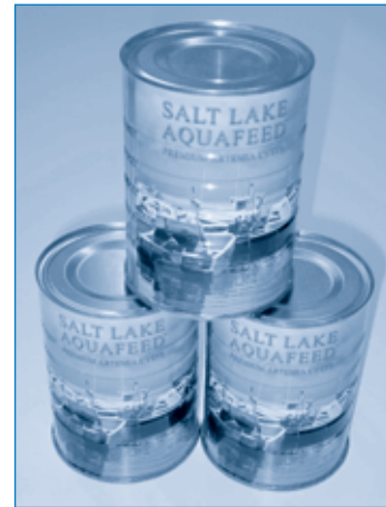
Salt Lake AQUAFEED Premium

For first feeding marine larvae, a special grade of artemia is available, meeting the requirements of the delicate larvae. This grade, the high HUFA, is harvested from selected ponds, where adult artemia feed on special algae species ensuring a high level of (n-3) HUFA in the artemia cysts. The high HUFA artemia give the smallest possible nauplii.