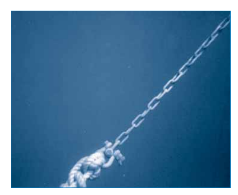
Various cables and chains types are available.

Various types can be delivered such as, galvanized steel chain, alloy steel chain, short link chain, long link chain, high grade alloy steel chain, etc. Please specify your needs and we will make an offer.