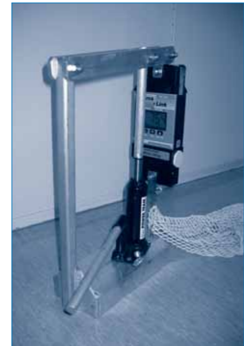
The net-tester is easy to use and to move.